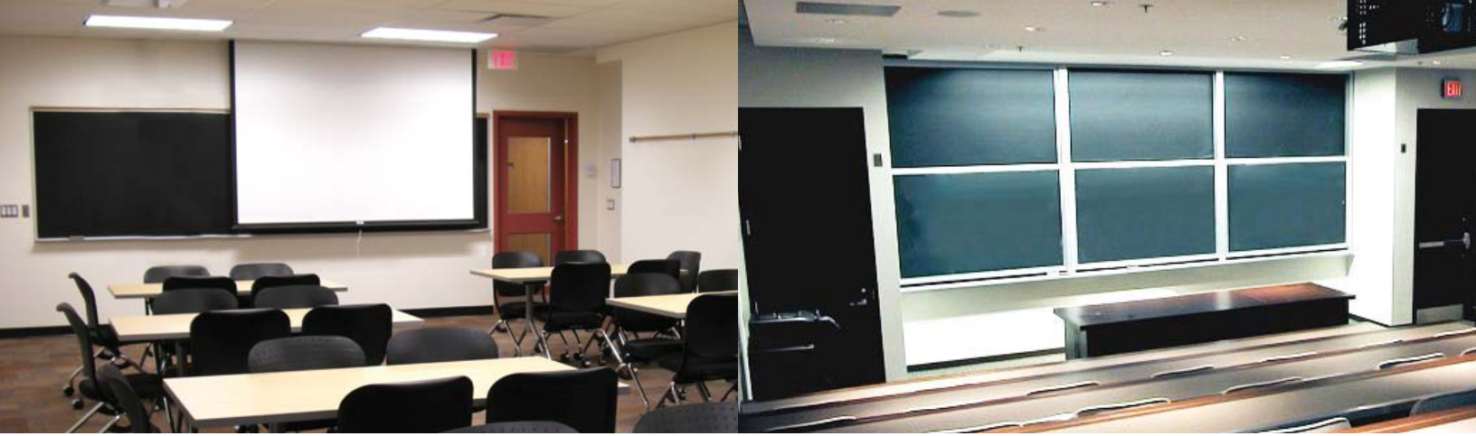
offset screen, standard blackboards presentation wall